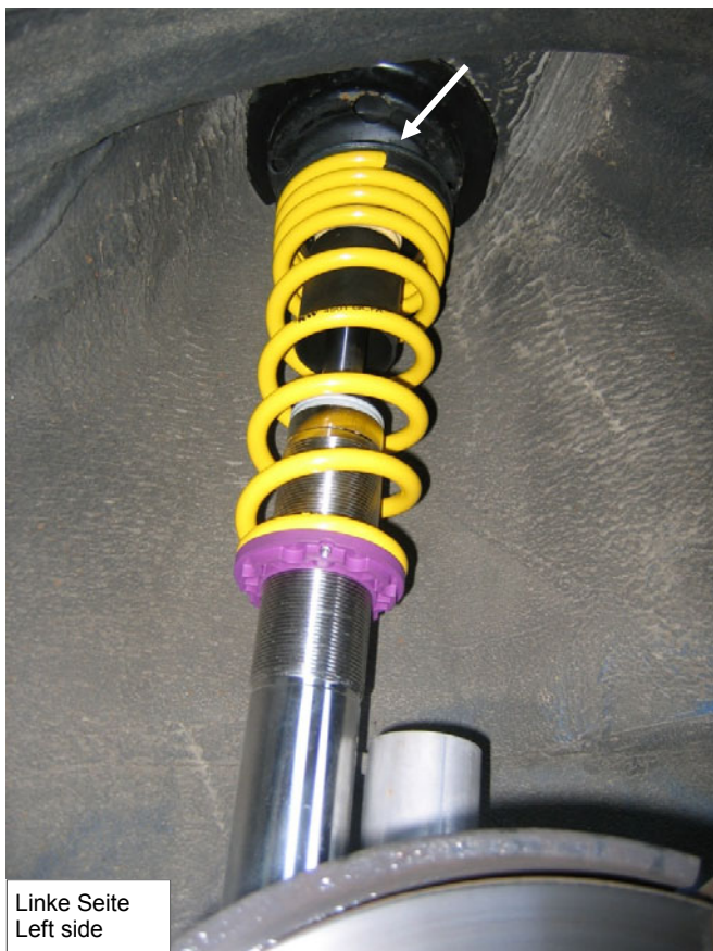
Linke Seite Left side

The upper end of the spring must show towards the left vehicle side.