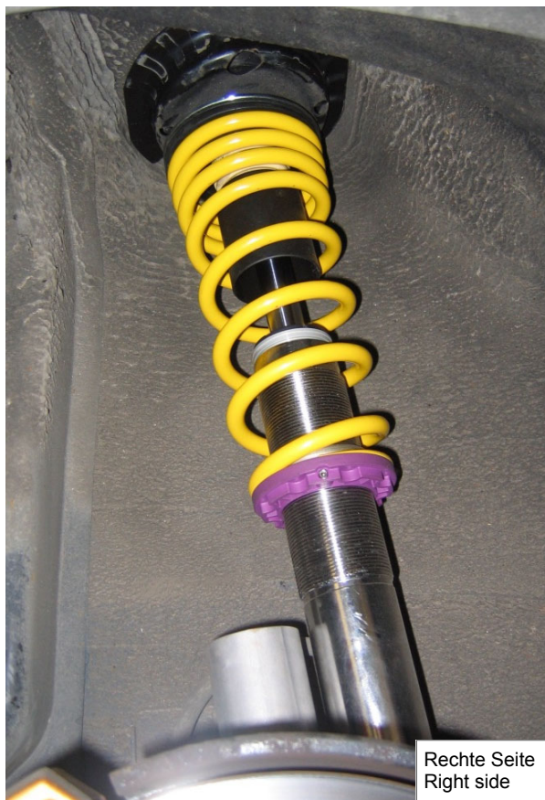
Rechte Seite Right side