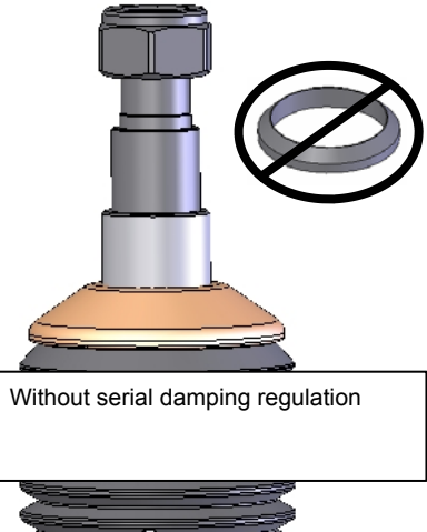
Without serial damping regulation

Install the factory supporting bearing and fix it with the supplied stop nut. Tightening torque for the piston rod nut is 50 Nm (37 ft-lb). The strut unit has to be installed according to manufacturers recommended settings regarding tightening torque and fixing specifications.