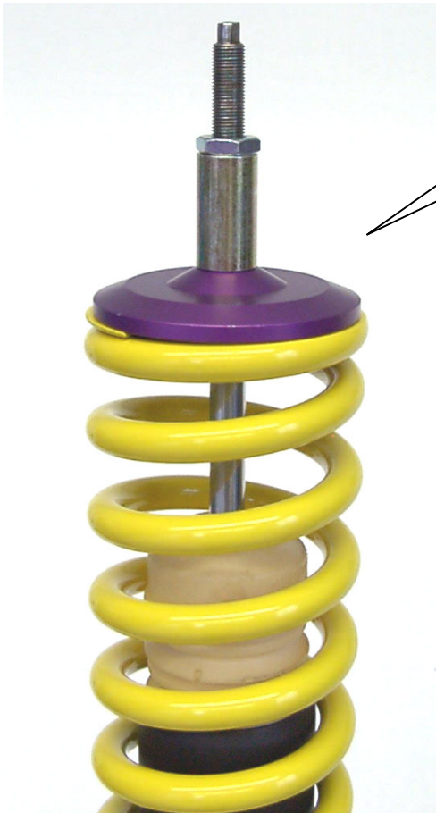
Supplied coilover strut

Put on the original supporting bearing rubber and the center disc, as shown on the picture and fix the coilover strut with the original parts like the original suspension with the car body. tightening torque to 25 Nm (18 ft-lb). Please take the installation notes of the coilover strut in the vehicle from the car manual of the car manufacturer.