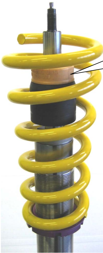
Supplied coilover strut.

Put the original supporting bearing on the coilover strut and fix it with the supplied stopp nut. Tightening torque for the piston rod is 35 Nm (26 ft-lb). Please install the strut unit to manufacturers recommended settings regarding tightening torque and fixing specifications.