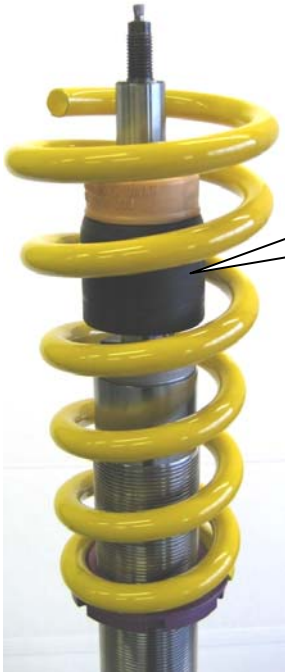
Supplied coilover strut.

Put the original supporting bearing on the coilover strut and fix it with the supplied stopp nut. Tightening torque for the piston rod is 35 Nm (26 ft-lb). Please install the strut unit to manufacturers recommended settings regarding tightening torque and fixing specifications.