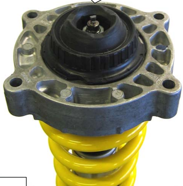
Assembled coilover strut in the car.

On damper versions with separate reservoirs, mount the reservoir facing the rear of the vehicle as shown on the picture.