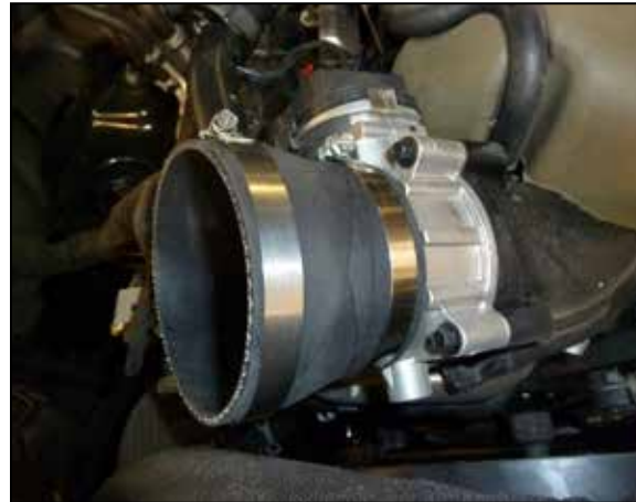
13. Install the step coupler onto the throttle body and secure with the provided hardware.