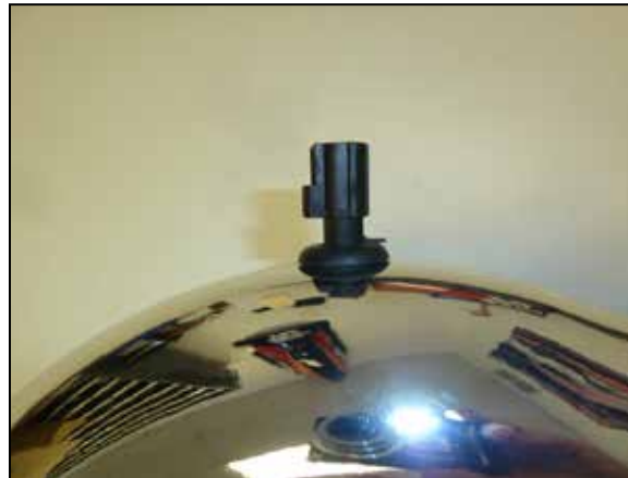
15. Remove the IAT sensor from the factory intake tube and then remove the O-Ring from the sensor. Using the provided grommet, install the sensor into the K&N intake tube as shown. NOTE: The IAT sensor is very fragile, use caution while handling the sensor so as not to damage it.