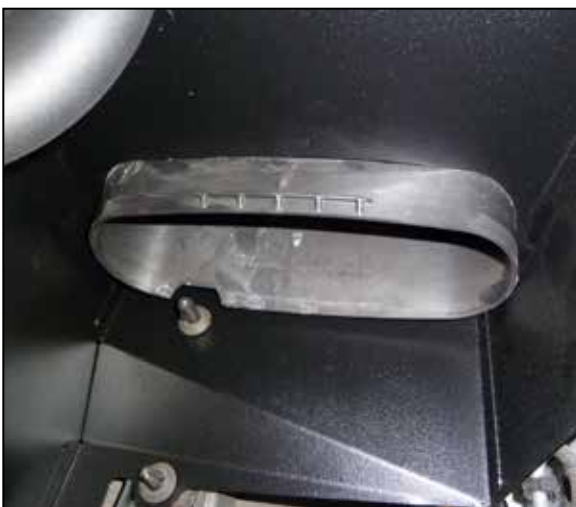
11. Insert the fresh air intake duct into the K&N heat shield.