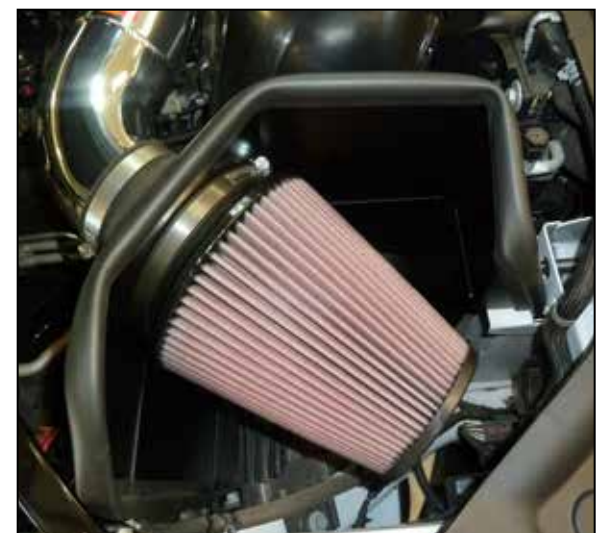
20. Install the K&N air filter and secure with the provided hose clamp.