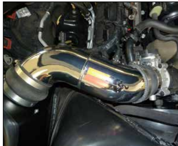
16. Install the intake tube into the couplers, position for best fit and then secure with the provided hose clamps.