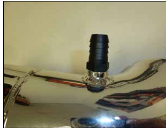
14. Install the provided vent fitting into the K&N intake tube as shown.