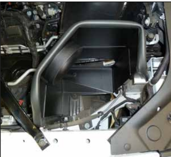
10. Install the K&N heat shield into the vehicle.