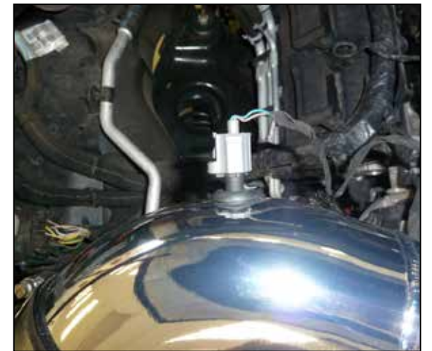
18. Reconnect the IAT sensor electrical connection.