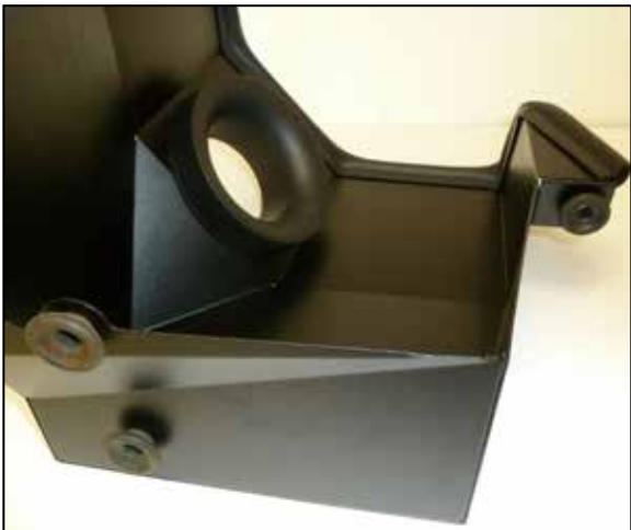
9. Remove the three mounting grommets from the factory air filter housing and install them into the K&N heat shield as shown.