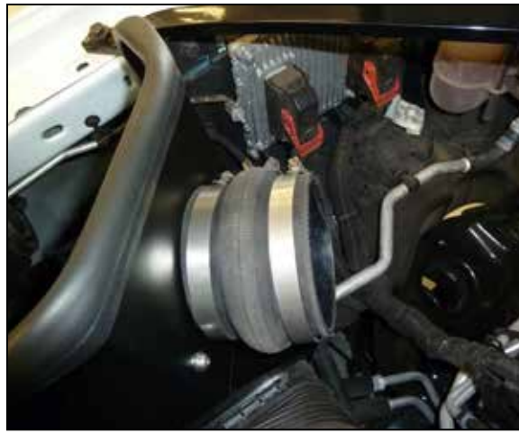
12. Install the provided hump coupler onto the filter adapter and secure with the provided hose clamp.