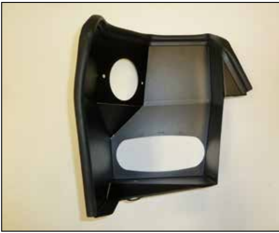
7. Install the provided edge trim onto the K&N heat shield as shown.