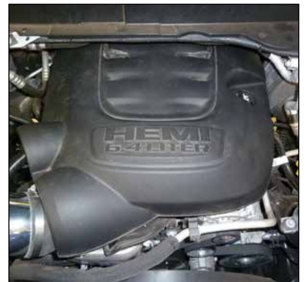
19. Reinstall the engine cover.