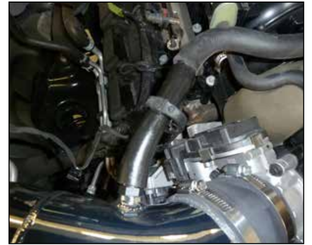
17. Remove the short section of the factory CCV hose and install the straight section provided. Connect the CCV hose to the fitting installed into the K&N intake tube.