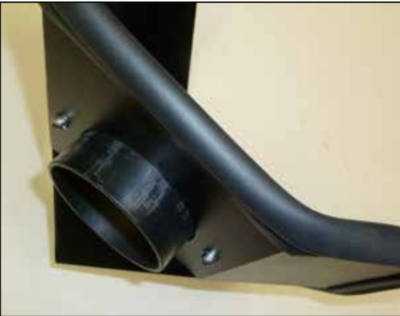
8. Install the filter adapter into the heat shield and secure with the provided hardware.