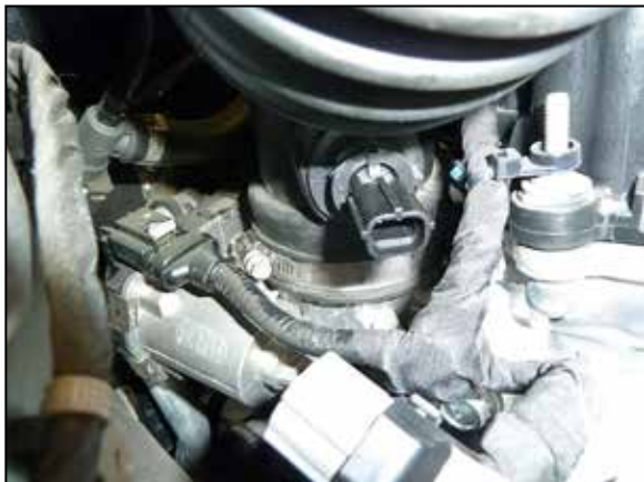
9. Loosen the hose clamp that secures the intake tube to the throttle body and then remove the intake tube from the vehicle.