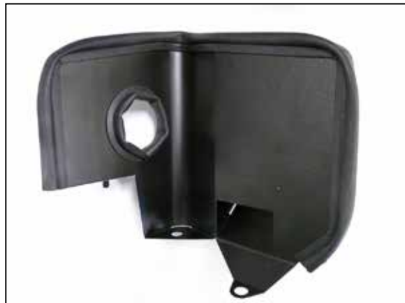
14. Install the edge trim onto the heat shield as shown.