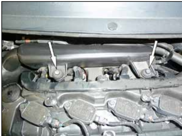
8. Remove the two bolts shown that secure the factory intake tube.