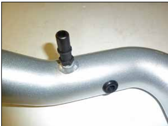
11. Install the provided grommet and quick disconnect fitting into the K&N intake tube as shown.

NOTE: Plastic NPT fittings are easy to cross thread. Install the vent fitting "hand" tight, then turn it two complete turns with a wrench.