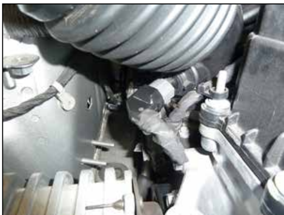
7. Disconnect the IAT sensor electrical connection.