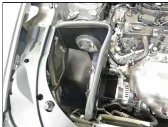
17. Install the heat shield into the vehicle as shown so the mounting studs insert into the grommets.