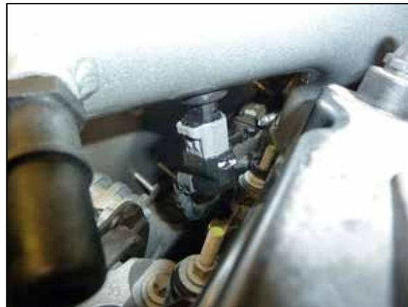
20. Reconnect the IAT sensor electrical connection.