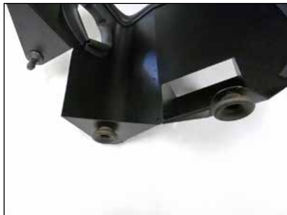
16. Install the two factory air filter housing mounting brackets onto the heat shield as shown.