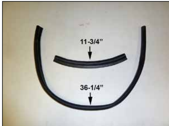
13. Cut the edge trim into two sections as shown.