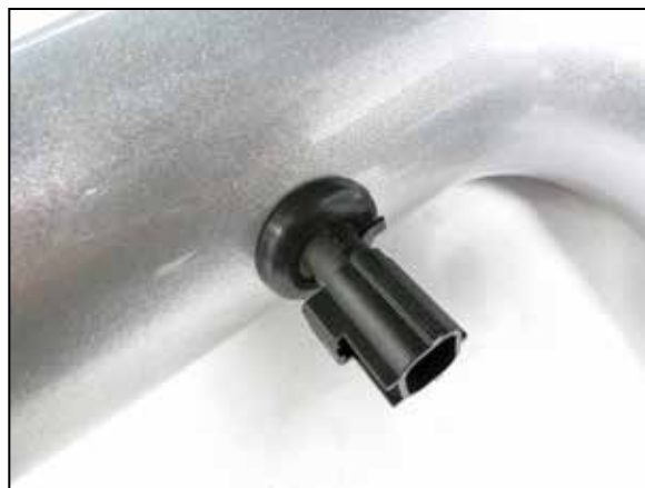
12. Install the IAT sensor into the grommet installed into the K&N intake tube.

NOTE: Plastic NPT fittings are easy to cross thread. Install the vent fitting "hand" tight, then turn it two complete turns with a wrench.