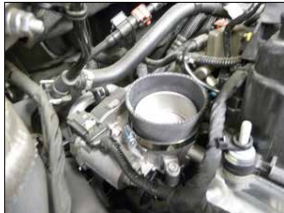
18. Install the provided coupler onto the throttle body and secure with the provided hose clamp.