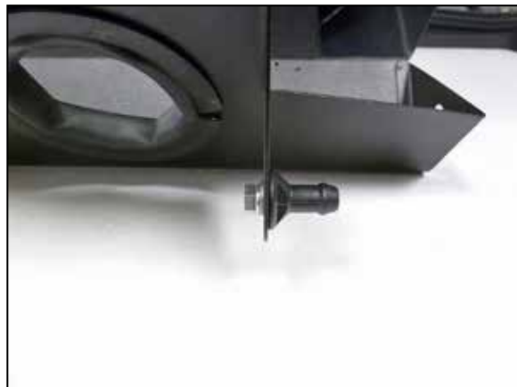
15. Install the mounting stud onto the heat shield as shown.