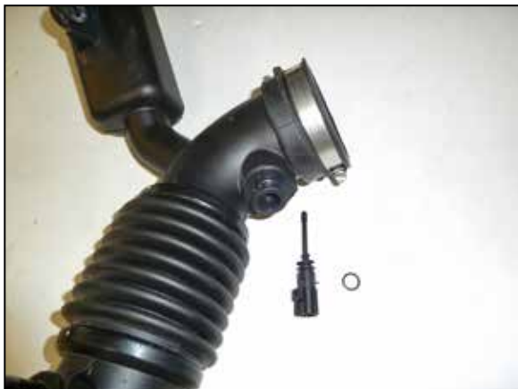
10. Remove the IAT sensor from the factory intake tube and remove the O-Ring from the sensor.