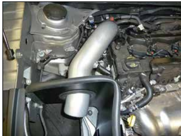
19. Install the K&N intake tube into the heat shield and then into the coupler, adjust the tube for best fit and then secure with the provided hose clamp.