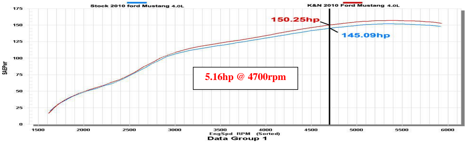
Data Group 1