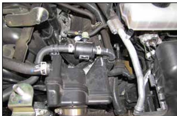
4. Release the spring clamps and then disconnect the crank case vent lines from the factory intake tube. Unhook EVAP hose retaining clips from the factory intake tube.