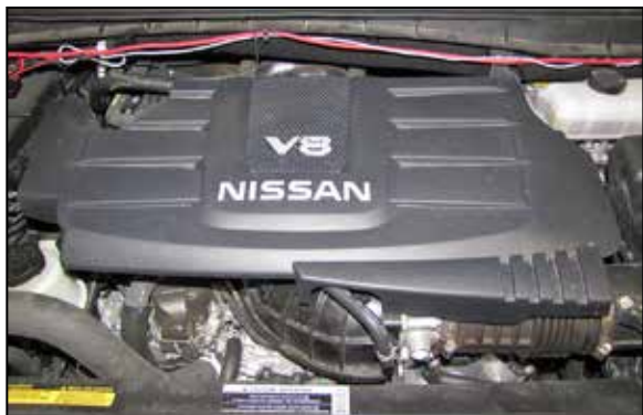
2. Lift off the decorative engine cover.

1. Turn off the ignition and disconnect the negative battery cable. NOTE: Disconnecting the negative battery cable erases pre-programmed electronic memories. Write down all memory settings before disconnecting the negative battery cable. Some radios will require an anti-theft code to be entered after the battery is reconnected. The anti-theft code is typically supplied with your owner's manual. In the event your vehicles anti-theft code cannot be recovered, contact an authorized dealership to obtain your vehicles anti-theft code.