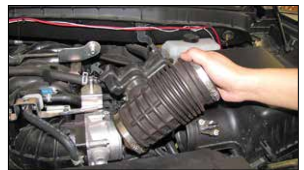
5. Loosen the two hose clamps that secure the factory intake tube and then remove the tube from the vehicle.