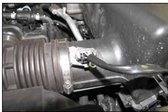
3. Disconnect the mass air sensor electrical connection and unhook the wiring harness from the air filter housing.