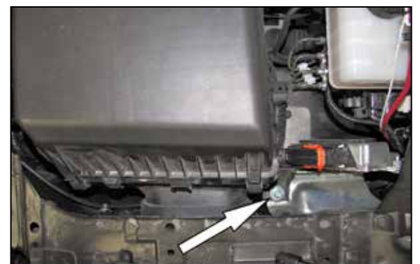
6. Remove the bolt shown that secures air filter housing to the inner fender and then lift the air filter housing up to dislodge it from the mounting grommets and remove it from the vehicle. NOTE: K&N Engineering, Inc., recommends that customers do not discard factory air intake.