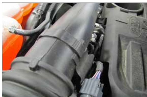
3. Disconnect the mass air wiring harness clip from the intake tube.