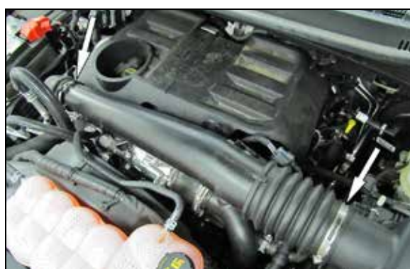
4. Loosen the two hose clamps that secure the factory intake tube and then remove the tube from the vehicle.