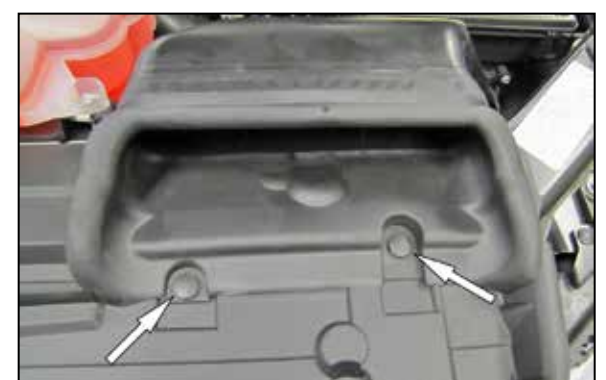
6. Remove the two clips that secure the fresh air intake duct to the core support.

NOTE: K&N Engineering, Inc., recommends that customers do not discard factory air intake.