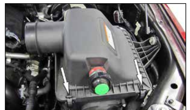
5. Release the two clips that retain the factory upper air filter housing and the remove the upper housing from the vehicle.

NOTE: K&N Engineering, Inc., recommends that customers do not discard factory air intake.