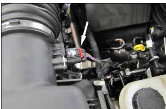
2. Disconnect the mass air sensor electrical connection.

1. Turn off the ignition and disconnect the negative battery cable. NOTE: Disconnecting the negative battery cable erases pre-programmed electronic memories. Write down all memory settings before disconnecting the negative battery cable. Some radios will require an anti-theft code to be entered after the battery is reconnected. The anti-theft code is typically supplied with your owner's manual. In the event your vehicles anti-theft code cannot be recovered, contact an authorized dealership to obtain your vehicles anti-theft code.