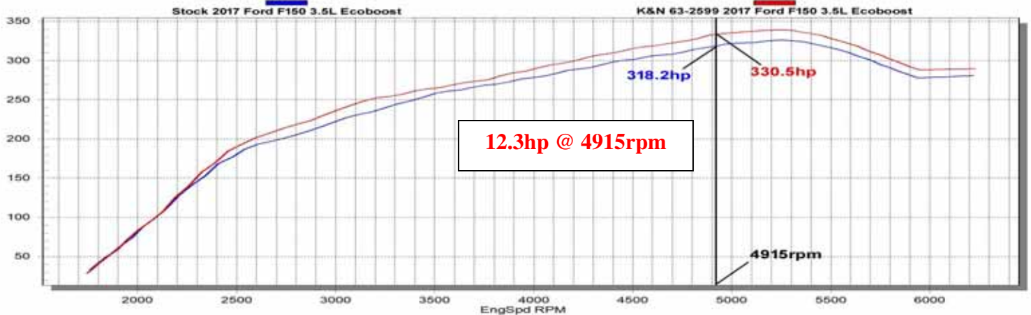
Data Group 1