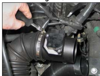
Fig. # 22