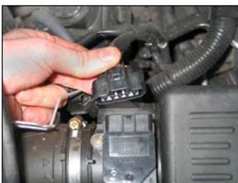
Fig. # 1

FILTER MAINTENANCE: K&N suggests checking the filter periodically for excessive dirt build-up. When the element becomes covered in dirt (or once a year), service it according to the instructions on the Recharger service kit available from your K&N dealer, part number 99-5003EU