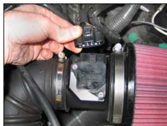
Fig. # 26