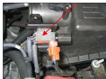
Fig. # 6