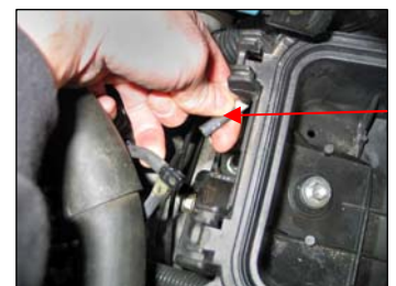
Fig. # 4