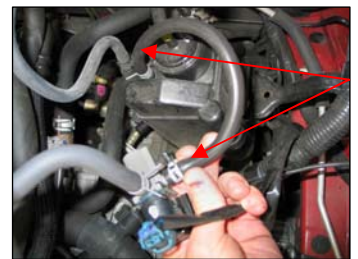
Fig. # 16