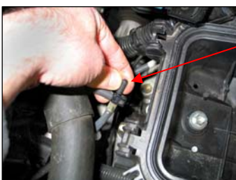
Fig. # 5