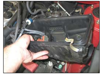
Fig. # 12