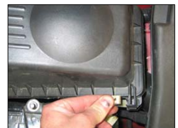
Fig. # 8