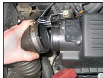
Fig. # 3