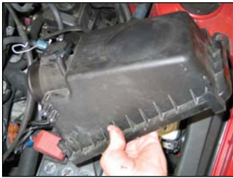
Fig. # 9