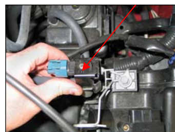
Fig. # 7