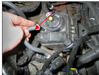
Fig. # 14