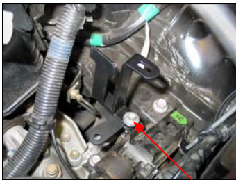
Fig. # 13