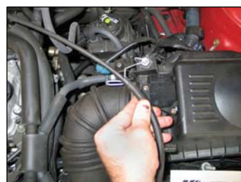
Fig. # 2