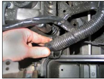
Fig. # 10