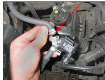
Fig. # 15