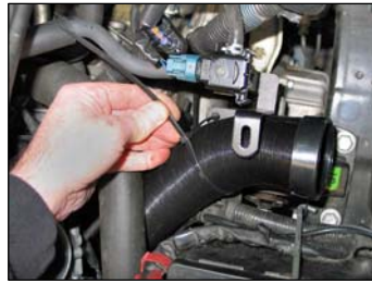
Fig. # 18