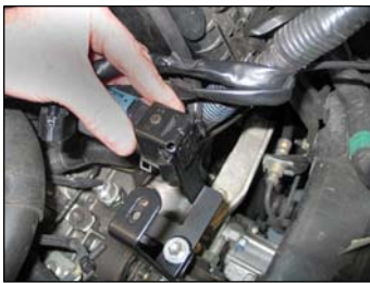
Fig. # 17