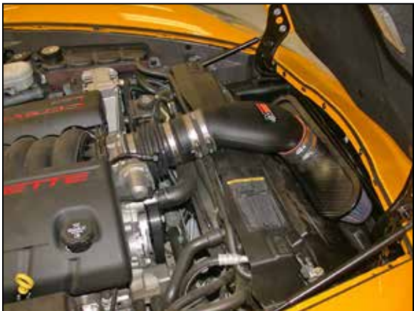
14. Reconnect the vehicle's negative battery cable. Double check to make sure everything is tight and properly positioned before starting the vehicle.