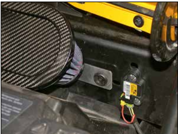
12. Snap the filter-mounting bracket onto the filter as shown and secure with the provided hardware.