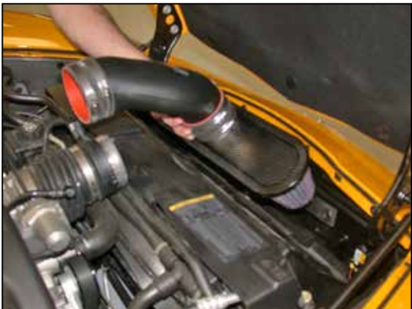
11. Install the intake kit assembly into the vehicle as shown.