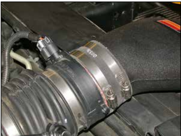
13. Install the intake kit onto the mass air sensor secure with the provided hose clamp.