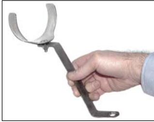
Fig. # 9