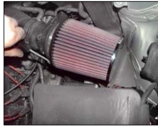
Fig. # 15