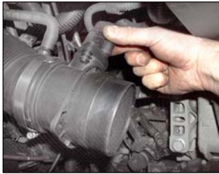
Fig. # 13