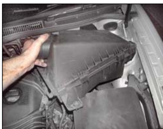
Fig. # 5