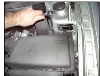
Fig. # 4