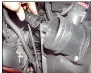
Fig. # 3