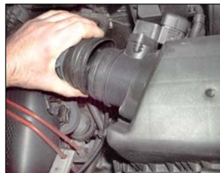
Fig. # 2