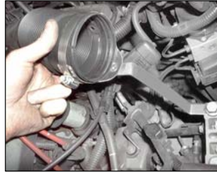
Fig. # 11