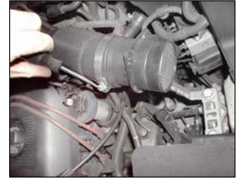
Fig. # 12