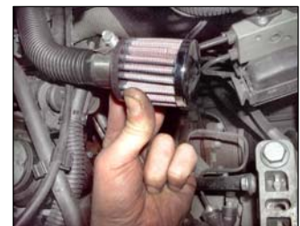
Fig. # 8