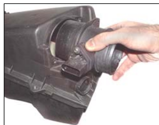
Fig. # 6