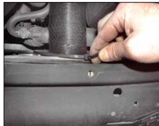
Fig. # 19