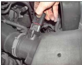
Fig. # 1

WARNING: Before starting the engine carry out a final fitment check of the K&N performance kit. It will be necessary for all intake systems to be checked periodically for realignment, clearance and tightening of all connections. Failure to follow the above instructions or proper maintenance may void the warranty.