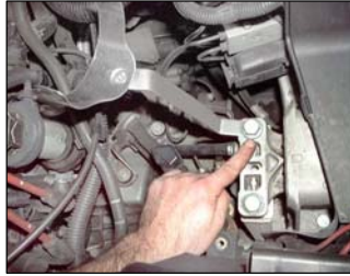
Fig. # 10