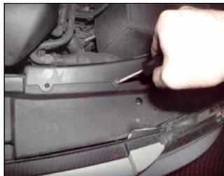
Fig. # 18