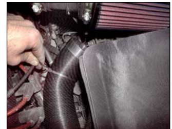
Fig. # 20