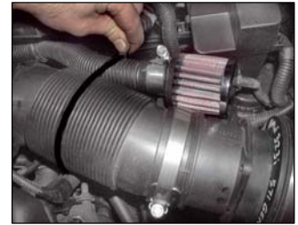
Fig. # 16