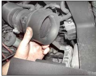
Fig. # 14