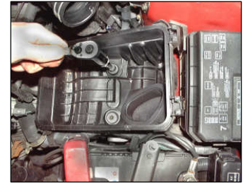
Fig. # 4