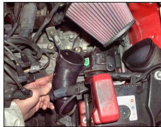
Fig. # 10