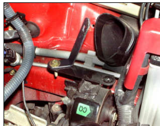
Fig. # 6