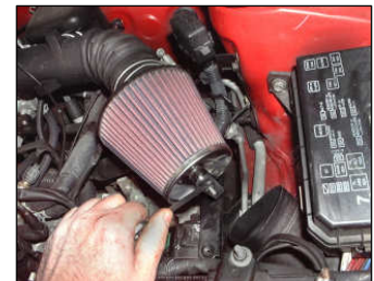
Fig. # 8