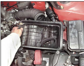
Fig. # 5