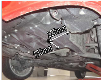
Fig. # 11