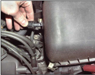
Fig. # 1