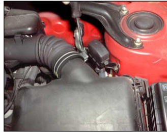
Fig. # 2