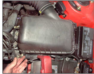
Fig. # 3