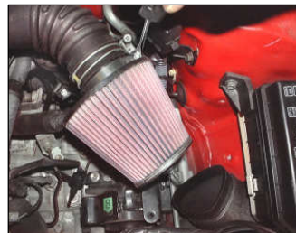
Fig. # 7