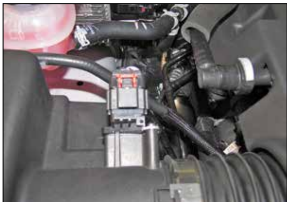
2. Disconnect the mass air sensor electrical connection.