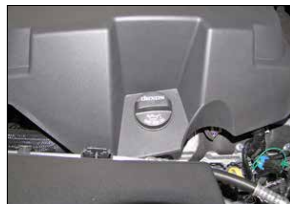
5. Remove the oil cap.