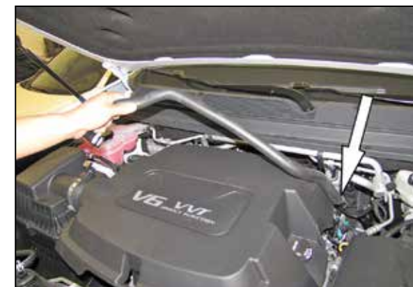
3. Disconnect the crank case vent hose from the intake plenum and then disconnect it from fitting on the valve cover and then remove it from the vehicle.