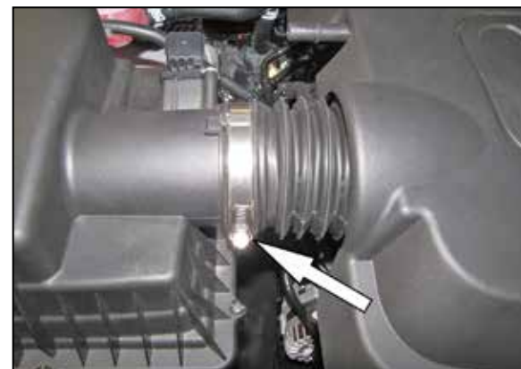
4. Loosen the hose clamp that secures the intake tube to the air filter housing.