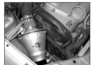
Apollo with end cap / cold air hose fitted