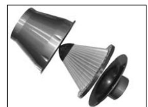
K&N Apollo stripped for element cleaning