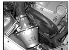
Apollo without end cap / cold air hose fitted