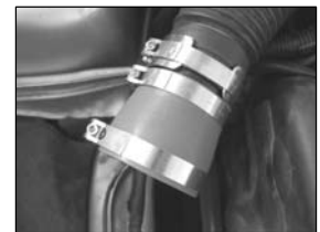
K&N rubber hose adaptor (K&N accessories)