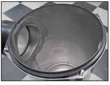
Fig. 1 Fig. 2 Fig. 3 Fig. 4