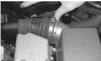
3. Remove the intake hose