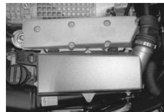
11. Install the lid and tighten all of the screws. NOTE: Installing the intake tube would be advised.