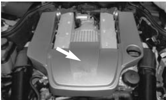
1. Remove front engine cover from vehicle.