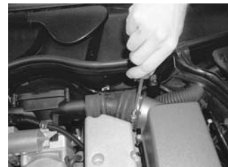
12. Tighten hose clamp. NOTE: Make sure that the hose clamp is snug.