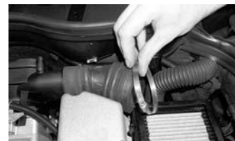
10. Install one of the supplied hose clamps onto the air intake tube.