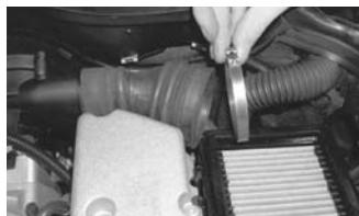
6. Remove factory hose clamp.