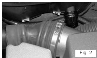
2. Unfasten the hose clamp. (Fig. 1) NOTE: When hose clamp is unfastened, it will look like figure 2.