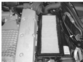
8. Install the K&N FILTERCHARGER ® air filter into the airbox