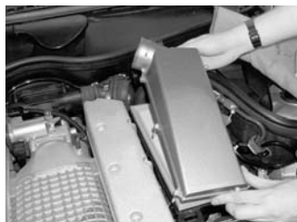
5. Remove lid from vehicle.