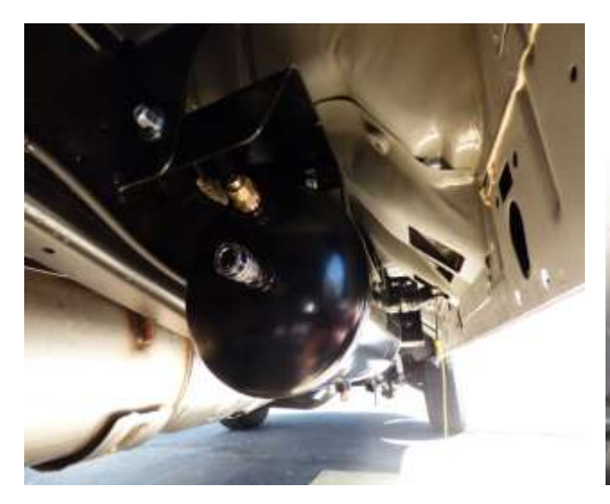
Location of Air System Installed (Passenger Side)

Thank you for purchasing a Kleinn Air Horns Super Duty Train Horn System. Kleinn Train Horn Systems are the only 100% bolt-on train horn and onboard air systems for 2011-2015 Ford F-250/F-350 trucks on the market today.