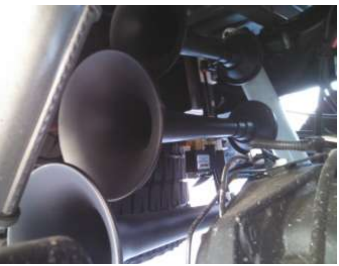
Location of Air Horn Installed (In front of spare tire)