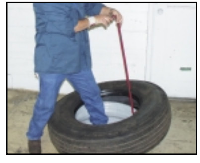
Lift small end , step through the wheel and pull tool across center of wheel.