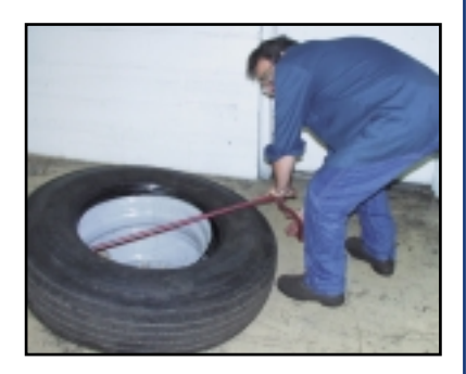
Push tool down to opposite side. First bead is now demounted. Remove tool from wheel. Do not pick up tire/wheel.