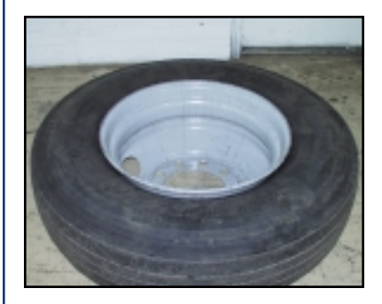
Break and lube both beads. Lay tire on floor with short side of wheel up.