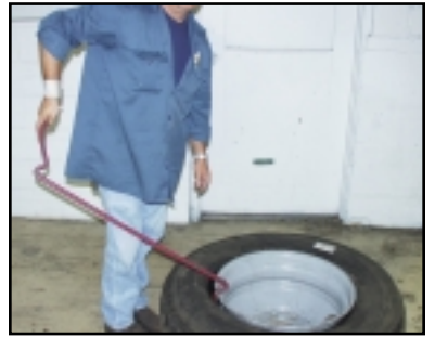
Lift large end. (Improper lifting will cause the tool to roll)