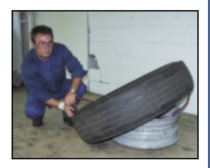
Push tool down to opposite side. Tire is now fully demounted.