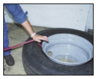
Keeping fingers out of the area between tool and tire/wheel, fully insert small end , between rim and tire bead nearest you, in top bead of tire.