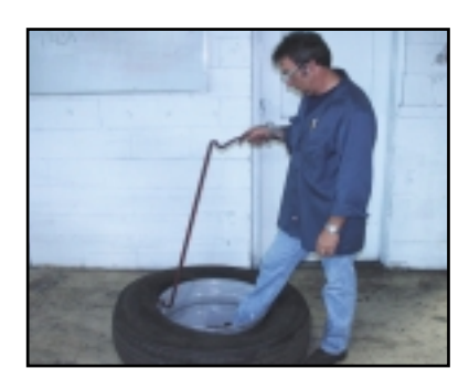
Step through the wheel and pull tool across center of wheel.