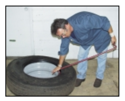
Fully insert large end into gap between wheel and tire until you feel bottom bead.