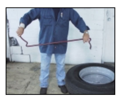
Hold curved part of large end , with the tip facing up, behind you.