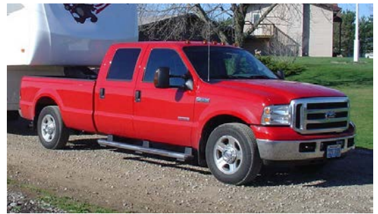
2005 & newer Ford Front

Kelderman Air Ride systems are developed for 2005 & newer Fords. This system was developed to improve the ride of the 3/4 & one-ton Ford pickups. There are several advantages to equipping your truck with air ride suspension: