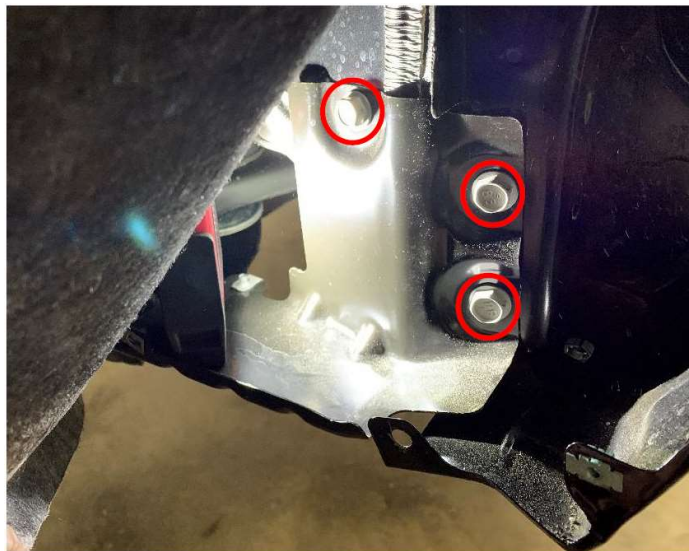
Figure 2: Inside mounting plate and bolts