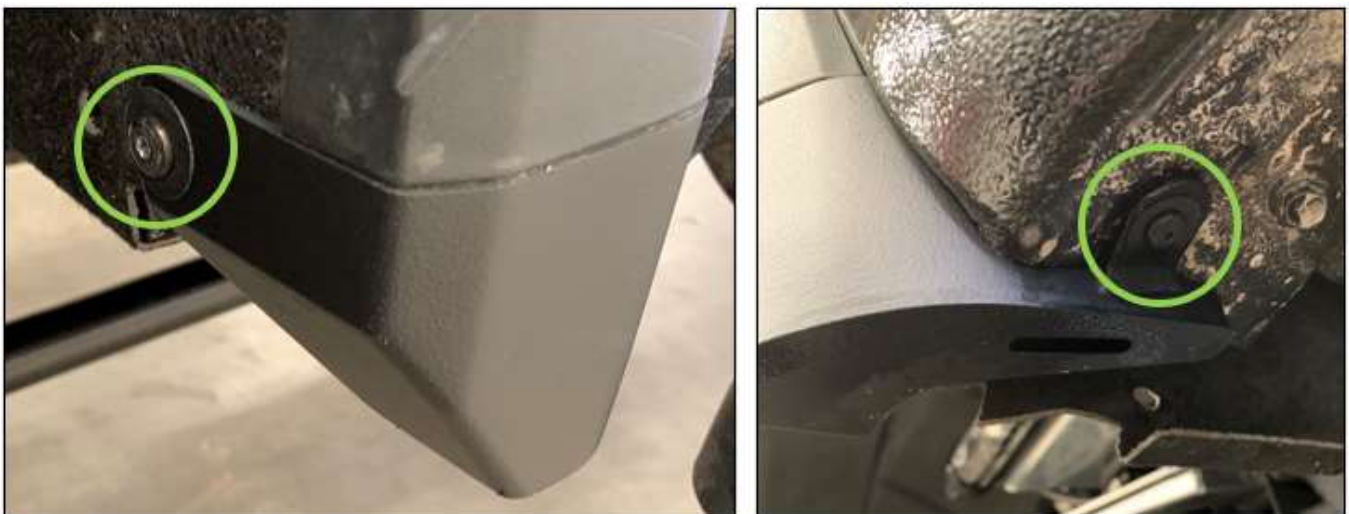
Figure 4: Kelderman fender flare cap installation points