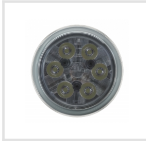
Part Number 3157491

12-48V LED Work Light with Polycarbonate Lens & Trapezoid Beam Pattern