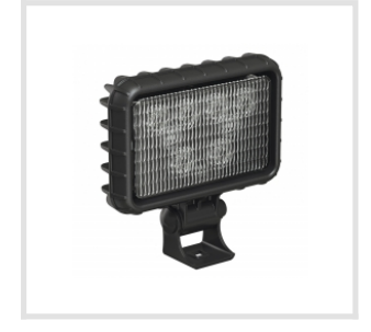
Part Number 1603261

12-24V LED Work Light with Spot Beam Pattern