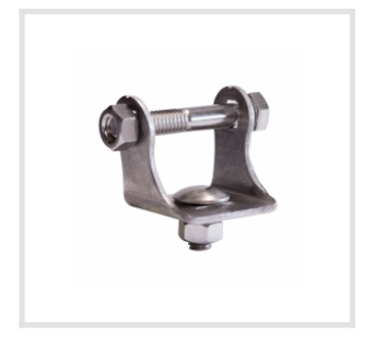
Part Number 8200101

Stainless Steel Mounting Kit for Work Lights & Marine Lights