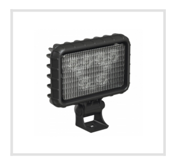
Part Number 1603331

12-24V LED Work Light with Trapezoid Beam Pattern & On/Off Switch