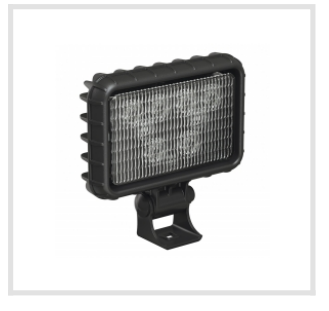
12-24V LED Work Light with Trapezoid Beam Pattern & On/Off Switch