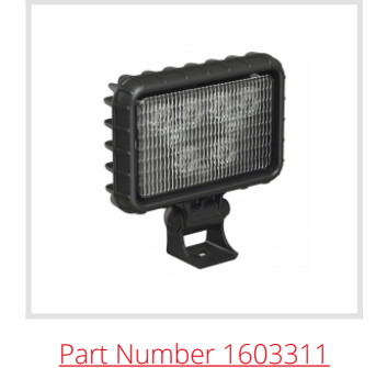
12-24V LED Work Light with Spot Beam Pattern & On/Off Switch