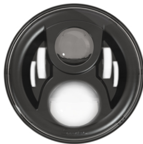
STANDARD HIGH BEAM