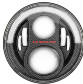
DUAL BURN™ HIGH BEAM