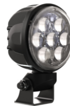
Part Number 0554201 12-110V LED Work Light with Trapezoid Pattern