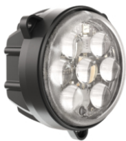
Part Number 0555461 12-24V LED Work Light with Flood Pattern & Panel Mount