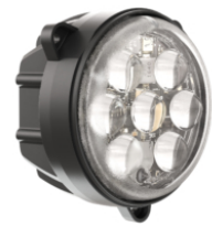
Part Number 0555341 12-24V LED Work Light with Spot Pattern & Panel Mount