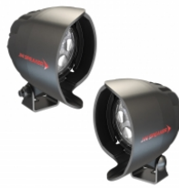
Part Number 0551753 12-24V LED Work Light with Spot Pattern & Side View Mirror Mount - 2 Light Kit