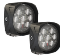
Part Number 0554873 12V LED Work Light Kit with Trapezoid Beam Pattern