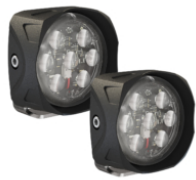
Part Number 0554863 12V LED Work Light Kit with Spot Beam Pattern