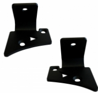
Part Number 6149233 A-Pillar Mounting Kit for Jeep TJ