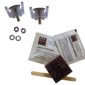
Part Number 8200491 Mounting Kit For Work Lights