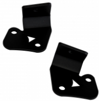
Part Number 6149203 A-Pillar Mounting Kit for Jeep JK