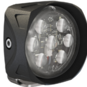
Part Number 0554871 12V LED Work Light with Trapezoid Beam Pattern