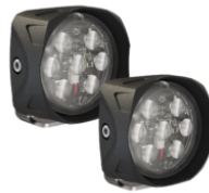
Part Number 0554873 12V LED Work Light Kit with Trapezoid Beam Pattern