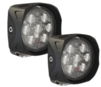
Part Number 0555003 12V LED Work Light Kit with Flood Beam Pattern