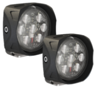
Part Number 0554863 12V LED Work Light Kit with Spot Beam Pattern