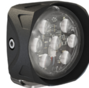
Part Number 0555001 12V LED Work Light with Flood Beam Pattern