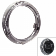
Part Number 3156351 Mounting Ring Kit for 7" Round (PAR56) Headlights