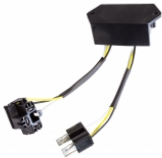
Part Number 8000381 H4/H4 Anti-Flicker Harness for J.W. Speaker LED headlights