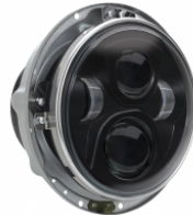
Part Number 3156561 Panel Mount Bucket Assembly for 8700 Evolution & 8710 Series