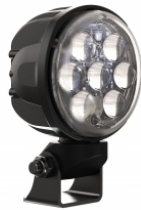
Part Number 0551001 12-24V LED Work Light with Spot Pattern