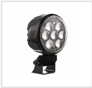
Part Number 0551001