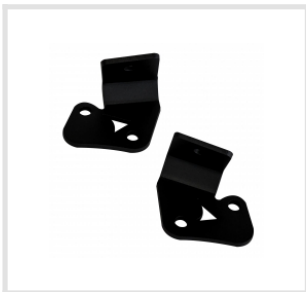
Part Number 6149203