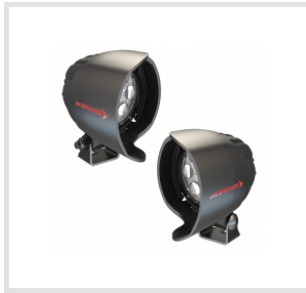
Part Number 0551753

12-24V LED Work Light with Spot Pattern & Side View Mirror Mount - 2 Light Kit