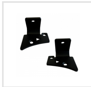
Part Number 6149233