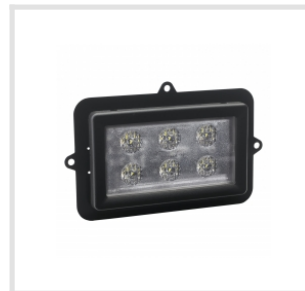
Part Number 0547431

12V LED Work Light with Flood Beam Pattern & Side Mount