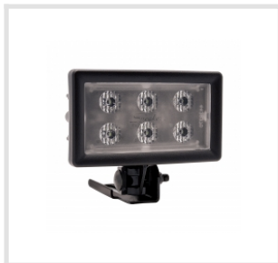
Part Number 0545971

12V LED Work Light with Flood Beam Pattern & Bottom Mount