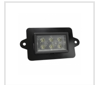
Part Number 0548311

12V LED Work Light with Flood Beam Pattern & Combine Retrofit Mount