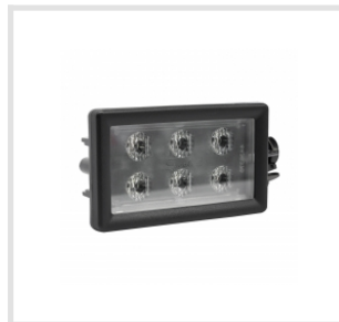
Part Number 0545981

12V LED Work Light with Flood Beam Pattern & Bottom Mount