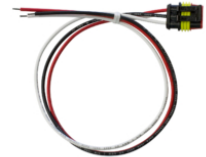
Part Number 3270501 3-Pin AMP Connector Wire Harness Assembly