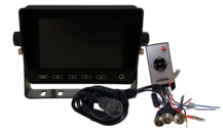
Part Number 6600801 COLOR MONITOR, 5", M12