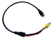
Part Number 3271571 M12-RCA CONVERSION CABLE