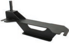
No Holes Base 425-6672