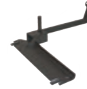
No Holes Base 425-5637