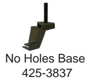
No Holes Base 425-3837