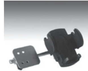
PIVOTING CELL PHONE HOLDER

Specifications subject to change without notice