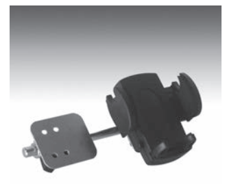
PIVOTING CELL PHONE HOLDER

Specifications subject to change without notice