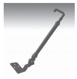
SCREEN SUPPORT - ACD

The Brace Kit attaches to the stand providing additional support. It can be adjusted in length and mounts to flat, vertical or angled surfaces.