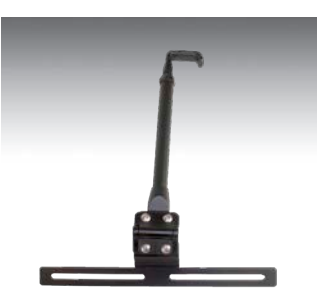
SCREEN SUPPORT - A-MOD

Computer securing system uses Kensington locking system. Fasten security cable to permanent structure in vehicle.