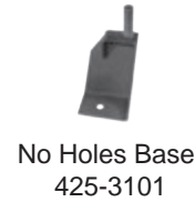
No Holes Base 425-3101