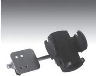
PIVOTING CELL PHONE HOLDER

Specifications subject to change without notice