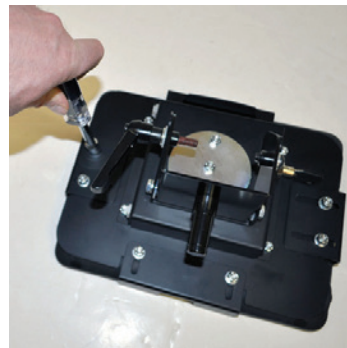
Tighten all locknuts.