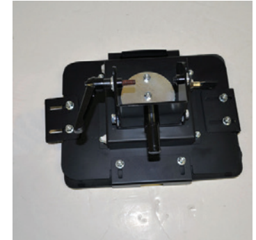
Flip mounting station over onto face.