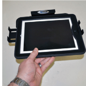
Place your tablet into Mounting Station