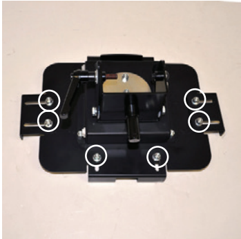
Loosen locknuts on back of Mounting Station. If iPad Air you will need to switch lower bracket out.