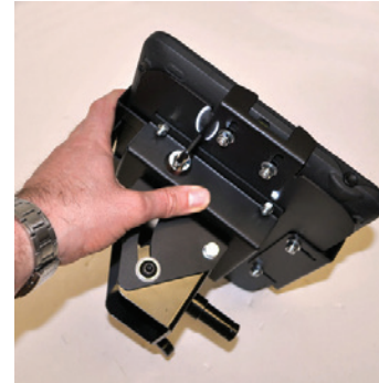
Lock your mounting station.