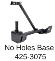
No Holes Base 425-3075