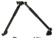
Brace Kit 425-5272