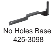
No Holes Base 425-3098