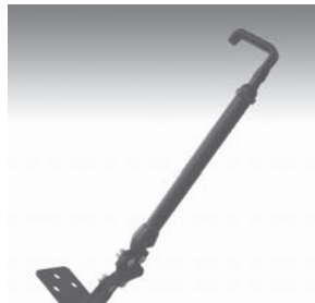
SCREEN SUPPORT - ACD

The Brace Kit attaches to the stand providing additional support. It can be adjusted in length and mounts to flat, vertical or angled surfaces.