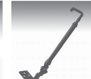
SCREEN SUPPORT - ACD

The Brace Kit attaches to the stand providing additional support. It can be adjusted in length and mounts to flat, vertical or angled surfaces.