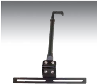
SCREEN SUPPORT - A-MOD

Computer securing system uses Kensington locking system. Fasten security cable to permanent structure in vehicle.