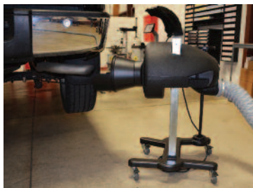
The height position is controlled by a quick-release spring-loaded cam lock.