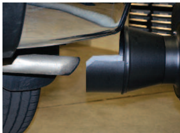
The high-output suction fan captures fumes and safely discharges them up to 30 ft. away, using the hose provided.