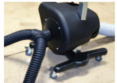
The EV-ADPT works with standard 3” exhaust hoses and “Y” hose adapters.