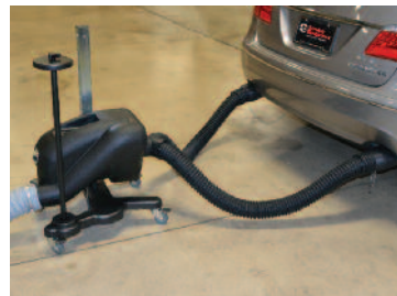
The “Y” Hose Adapter (EV-ADPT) is used with dual-exhaust vehicles and motorcycles.