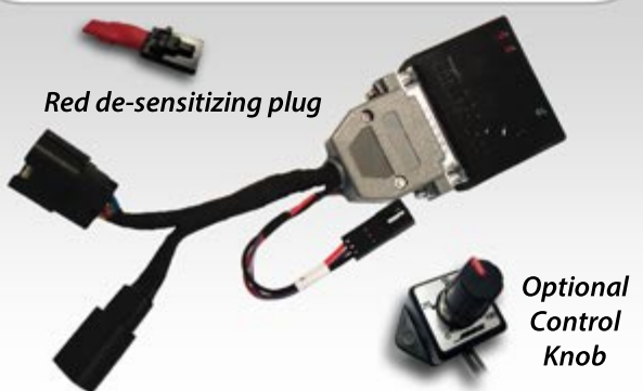
PedalMAX for 2008 - 2015 GM